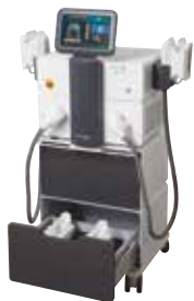
Ref. M92 * CRIOCUUM optional table