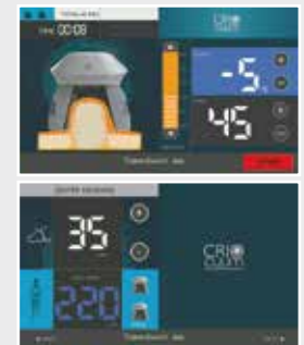
INTUITIVE SOFTWARE FOR THE TREATMENT CONFIGURATION